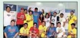
PICE UAE leaders