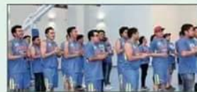
Blue team cheers and yells in their unique group performance